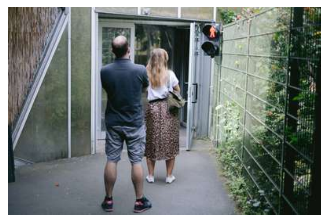
ViCo clearly communicates when visitors are allowed to enter via a traffic light. In addition, acoustic warnings will be given

well as to the parameters for the maximum number of visitors. A further expansion is planned with the installation of ViCo in the Aquarium. Furthermore, all traffic lights will be equipped with loud speakers in order to warn the visitors acoustically.