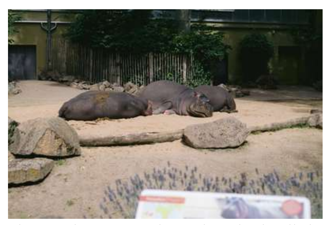
Cologne Zoo is relying on ViCo to control access to the Hippodom. This enables the visitors to enjoy watching the animals in a relaxed atmosphere.

Further information about ViCo is available here: <a href="www.vico-system.de">www.vico-system.de</a>